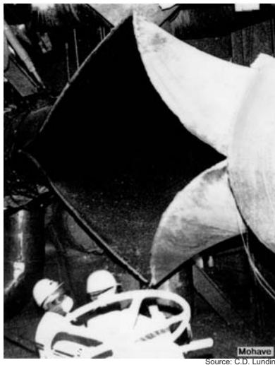
Figure 1: Catastrophic failure of the main steam pipeline along the longitudinal weldment in a US thermal power station.

Phase transformations during welding can be monitored in real-time by in-situ X-ray diffraction using synchrotron radiation. X-ray diffraction experiments will be carried out at the Advanced Photon Source of Argonne National Laboratory.