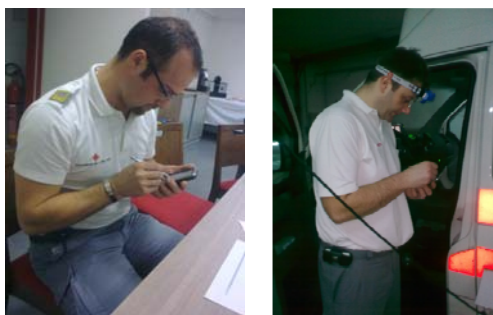
Figure 6: Participants during experiments in real life

The real life environment is mostly a seat in an ambulance car. To avoid negative effects on ambulance responder’s work, the experiment is done in their recess in the ambulance service rooms, simulating the circumstances (sitting in a car) by doing the experiment sitting on a chair, holding the PDA in their hand, without laying down the elbows on e.g. an armrest. (Kjeldskov et al., 2004) shows that simulating environments gives almost the same results.