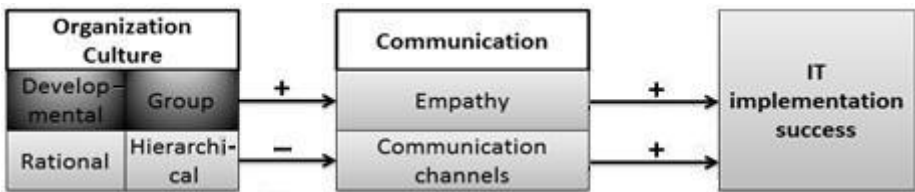
Fig. 2. Proposed Model for Improving IT Implementation Success

The review of the related work and the output of the conducted case study confirmed that communication channels and the empathy factor are key elements of communication related to successful IT implementation. These communication skills also have to be in line with the organization culture types. Communication focuses on the process and means to adopt IT, whereas, organization culture focuses on the value and norms regarding technology. Therefore, organization culture influences communication approaches for successfully implementing IT in hospitals. We think that strong organization cultures support greater sharing of information (group culture) and development of new approaches (developmental culture) which tend to facilitate communication by addressing empathy and communication channels and therefore facilitate IT adoption and implementation. Figure 2 shows the conceptual model derived from the integration of the findings from the case and literature study.